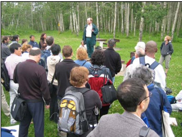
Excursion to Elk Island National Park